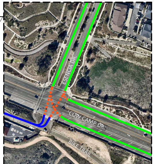
ESENCIA DR. AT COW CAMP RD. INTERSECTION DETAIL